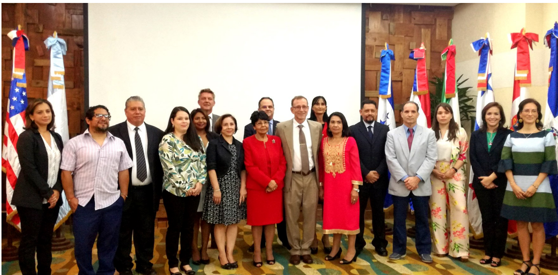
IAC Delegates and Secretary PT at the 9th Conference of Parties (COP9)

The Dominican Republic, host of the Ninth Conference of Parties (COP9) of the Inter-American Convention for the Protection and Conservation of Sea Turtles – IAC